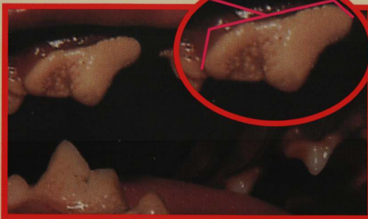
Dog's teeth 20 weeks after his teeth were cleaned (dog did NOT chew rawhide - resulting in plaque buildup)