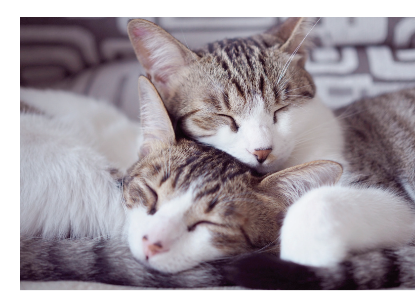
"I think one of the things that staff should never say to a cat guardian is, 'Cats are difficult."

The American Association of Feline Practitioners created the Cat Friendly Practice program to provide clinics with the tools to integrate a feline perspective in both the physical environment of the practice and the way medical care is delivered. Created by expert feline practitioners, the CFP program equips practices with the tools, resources, and information to elevate the treatment, handling, and overall health care of cats, as well as emphasizes ways to reduce the stress associated with the visit. To learn more, visit www.catvets.com/cfp.