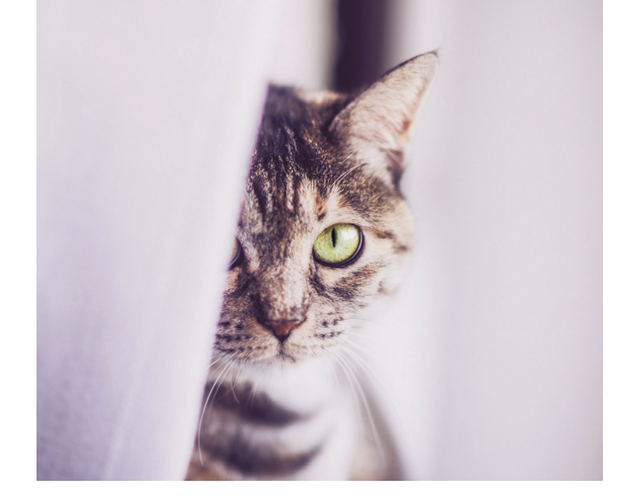
"We find that even some 'cat clients' don't truly understand their cat and their behavior."

Cats have different nutritional needs, various medication differences, and propensities toward certain conditions and diseases seen less frequently in dogs. In addition, Felsted points out that certain personality and behavioral differences often result in less care or delayed care for cats.